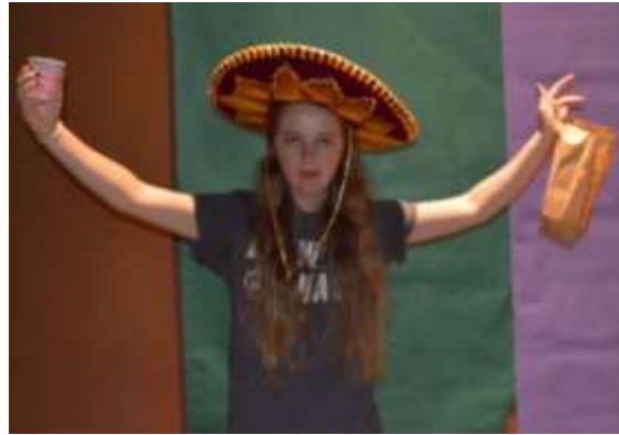
She Ate What?

Get your best body in 5 weeks with this crazy life hack!